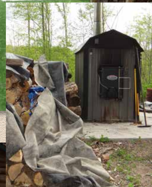
EVERYTHING DONE IN A BIG WAY!