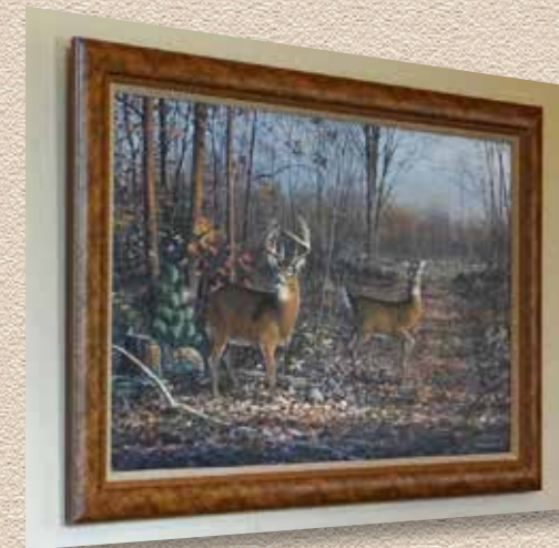
"Lover's Lane" painting by Scott Zoellick...a scene from an actual successful hunt at Full Draw 365.